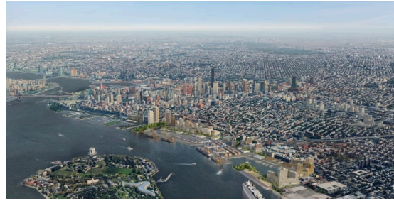
Oct 02 2025