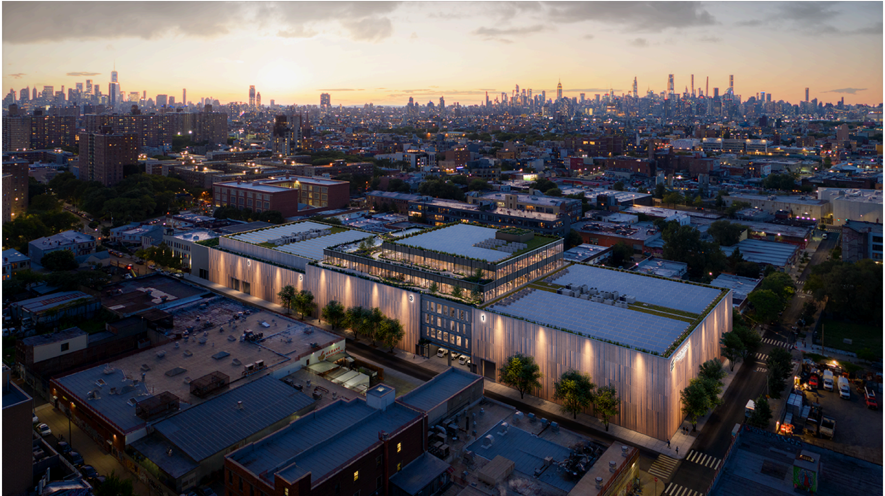
COOKFOX Architects; rendering by DBOX