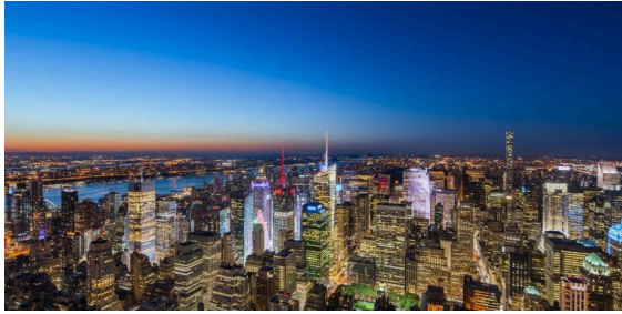
Oct 07 2025