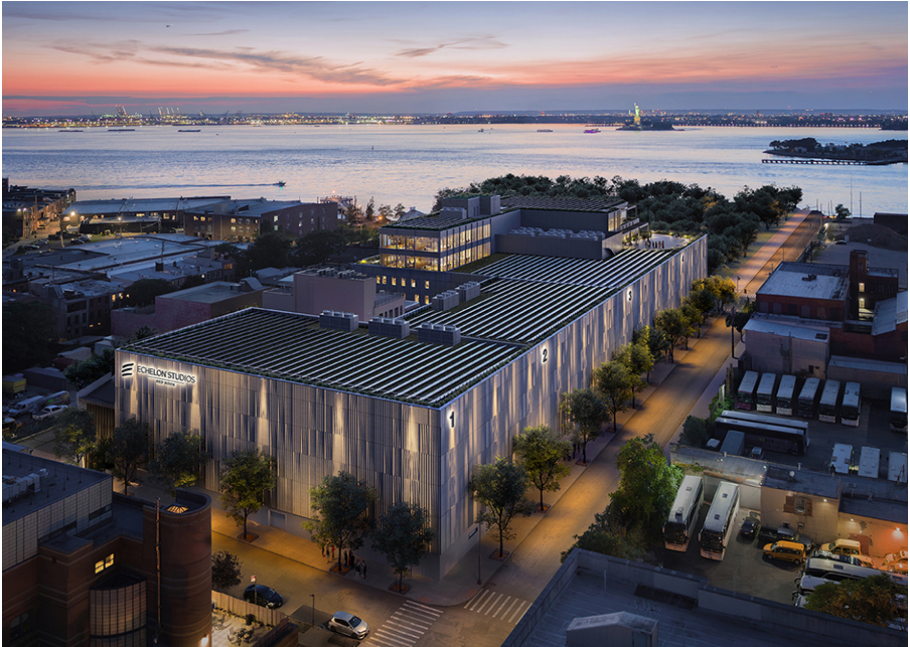
COOKFOX Architects; rendering by DBOX